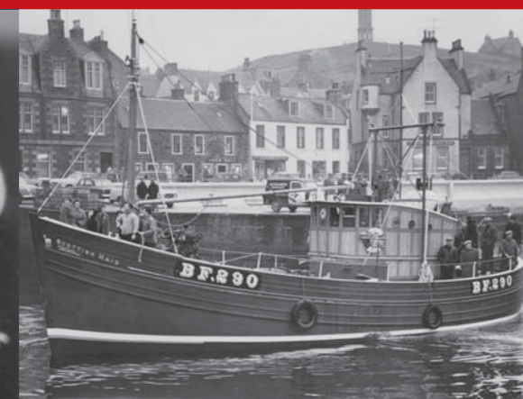
1968 first boat painted M/V Scottish Maid at Macduff.