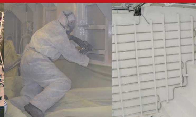
POLYUREA ENCASEMENT COATING | INSULATION FOAM INJECTION / SPRAYING