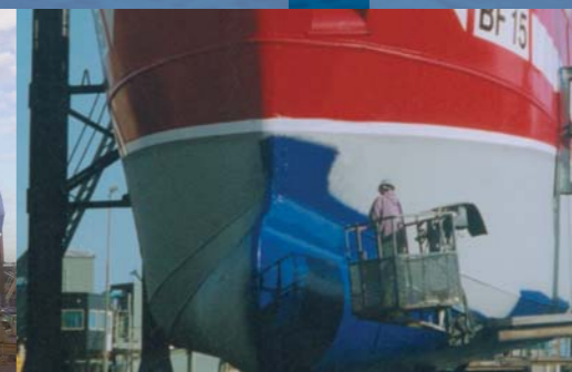
Painting Twin Rigger Aurelia