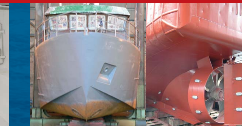
STEAM CLEANING | UHP WATER BLASTING