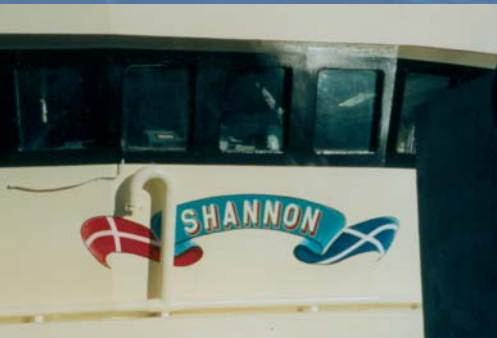
DANISH PELAGIC VESSEL - SHANNON

The finishing touches once the painting is completed. Sign writing and design is a specialised service provided.