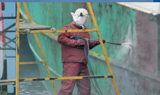
Water blasting Trawler Maggie .M.