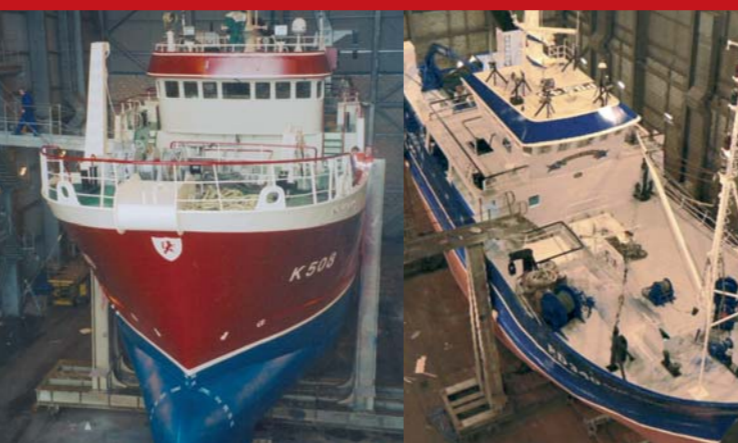
INDOOR SHIP LIFT & DRY DOCK FACILITY