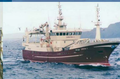
Pelagic Christina .S.