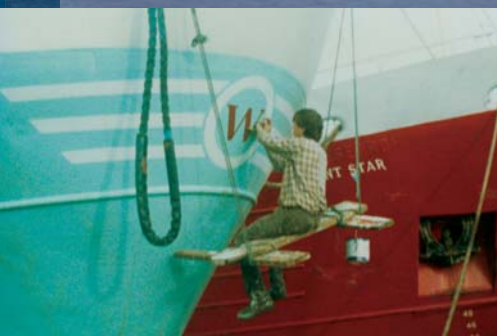
Peter Bruce Jr. signwriting from bo'suns chair 1986.

This can be used above and below ships waterlines where old coatings and anti foulings are removed. The pressure of the water is up to 30,000 p.s.i., cleaning back to the bare steel. This was done on the Challenge and the Steadfast vessels where the old coatings and anti foulings were removed and a four coat system was then applied.