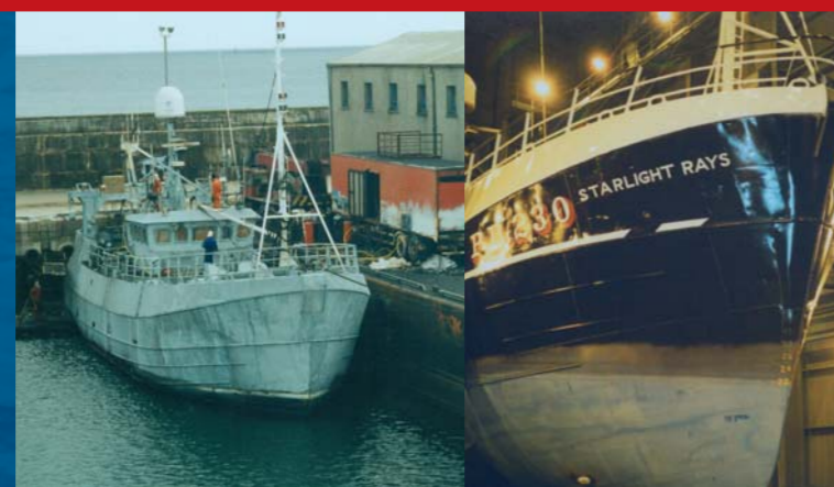
THE STARLIGHT RAYS

On completion, ready to return to Denmark with a new lease of life. The owners were delighted with the quality and efficiency of the work carried out.