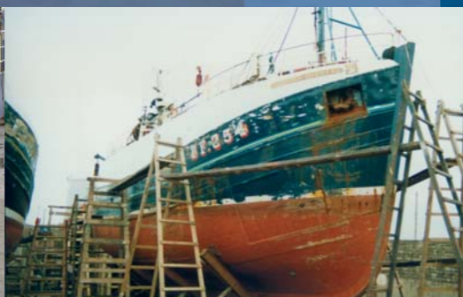
1987 Golden Sceptre on Fraserburgh's old slipway.