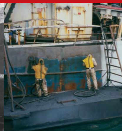
SHOT BLASTING | HOT METAL ZINC SPRAYING